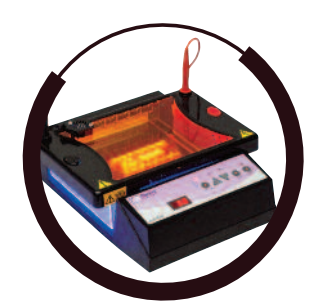
fit the bluVIEW lid and start the run to observe band in real time