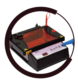
load samples as with the standard MSCHOICE tank