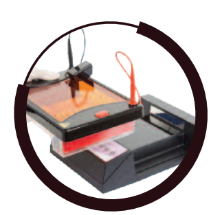
place the gel tank and agarose gel onto the base station

runVIEW is an innovative system that combines blue LED lighting and an inbuilt power supply to create a real time electrophoresis system giving you near instant verification of results. It is perfect for saving time in quick sample check or for teaching the principles of electrophoresis.